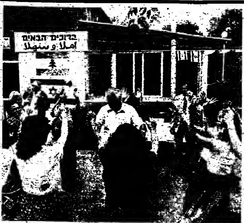
Teachers from South Lebanon dance with Upan Akiva students in Netanya on Friday. The 23 teachers were invited to Netanya for a two-day visit under the slogan "Peace Begins at Home," and were taken to visit a kibbutz and educational institutions.

Ehrlich called on "those who cherish democracy" to support the Begin government wholeheartedly. The government, Ehrlich said, should have cut inflation drastically by imposing economic restraint, which would create unemployment — as the late finance minister Pinhas Sapir tried before the Six Day War. However, the government was "pledged to a full-employment policy." Ehrlich said "no" to a suggestion by an anonymous participant to increase export incentives. One of the present causes of inflation, Ehrlich said, is that investments have been doubled. Investments from abroad resumed during the past year, and investment in industry increased by 15 per cent. Investment has an inflationary effect for a number of years, until it starts to show returns. Security expenses absorbed directly on the peace treaty with Egypt top $200b., also an inflationary factor, the minister said. "Israel will have to muster IL30b. from its own resources in addition to what the Americans supply to cover the expense of redeployment of its forces in the Negev," Ehrlich added. The housing shortage, Ehrlich estimated, would be over in about three years. There will be 300,000 new flats ready within five years. Ehrlich said he favors the sale of available state lands for housing.